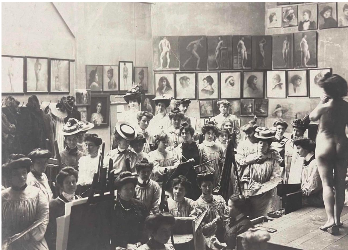
Fig. 1, Photograph from circa 1892 depicting a life class at the Académie Julian, with a series of bust-length head studies on the walls behind

Founded in 1868, the Académie Julian was a private art school which offered a program and level of teaching comparable to those of the École des Beaux-Arts. Unlike the École, which excluded women until 1897, the Académie Julian gave women artists the same opportunities as men, notably in giving them access to the life class and the chance to depict the nude. In fact, the Académie was the pre-eminent art school for women on an international level, achieving a reputation for excellence in academic figure studies, attracting students from across the western hemisphere.