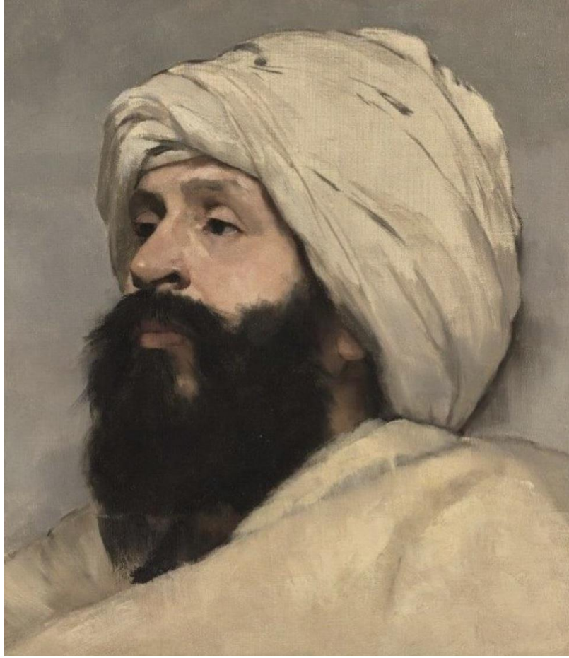
Fig. 2, Berthe Burgkan, Head study of a man in a fez , 1898, oil on canvas, 46.5 x 38 cm, Private Collection