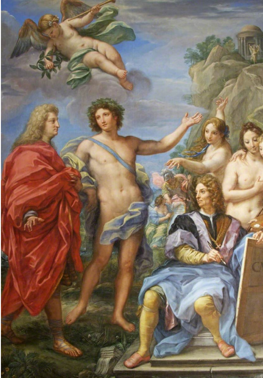
Fig. 4. Carlo Maratti, Ascent to the Temple of Virtue , 1706. Oil on canvas, 299.5 x 212 cm. Stourhead, Wiltshire, The National Trust (Hoare Collection).