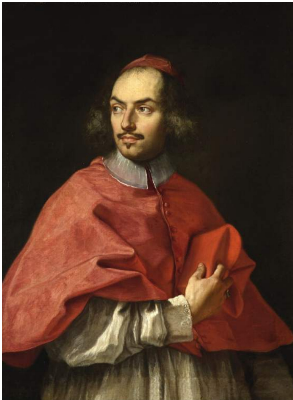
Fig. 10. Carlo Maratti, Portrait of Cardinal Giacomo Rospigliosi , 1668. Oil on canvas, 100 x 75.2 cm. Oxford, Fitzwilliam Museum.