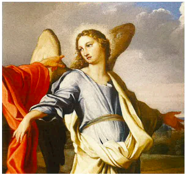
Fig. 2. Carlo Maratti, Tobias and the Angel , c. 1654-1655. Oil on canvas, 67.5 x 98 cm. Formerly Christie's New York, 26 January 2001 (Lot. 153).