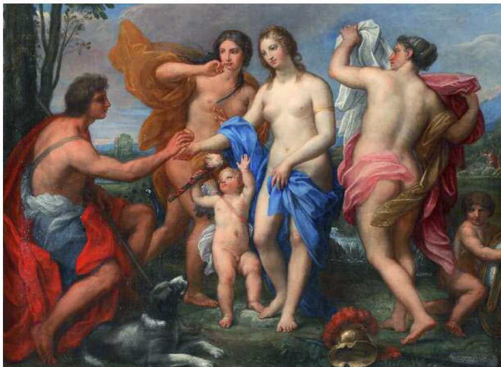
Fig. 7. Carlo Maratti, Judgement of Paris , 1708. Oil on canvas, 176 x 231 cm. St Petersburg, Tsarskoye Selo State Museum.