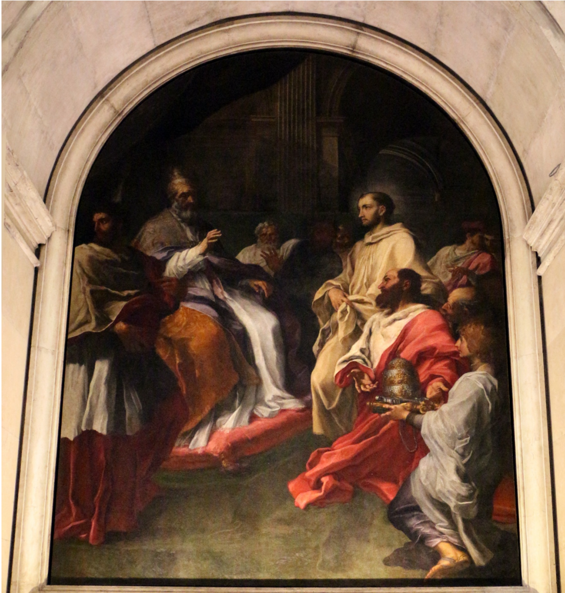
Fig. 9. Carlo Maratti, Saint Bernard Induces the Antipope Victor IV to Submit to Pope Innocent II , 1657-1658. Oil on canvas, dimensions not known. Rome, Church of Santa Croce in Gerusalemme