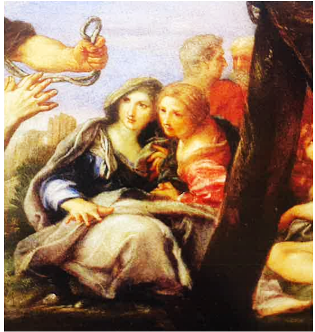
Fig. 1. Carlo Maratti, Saint Andrew Led to Martyrdom , c. 1660-1661. Oil on canvas, 120 x 160 cm. Formerly Christie's New York, 26 May 2000 (Lot. 59).