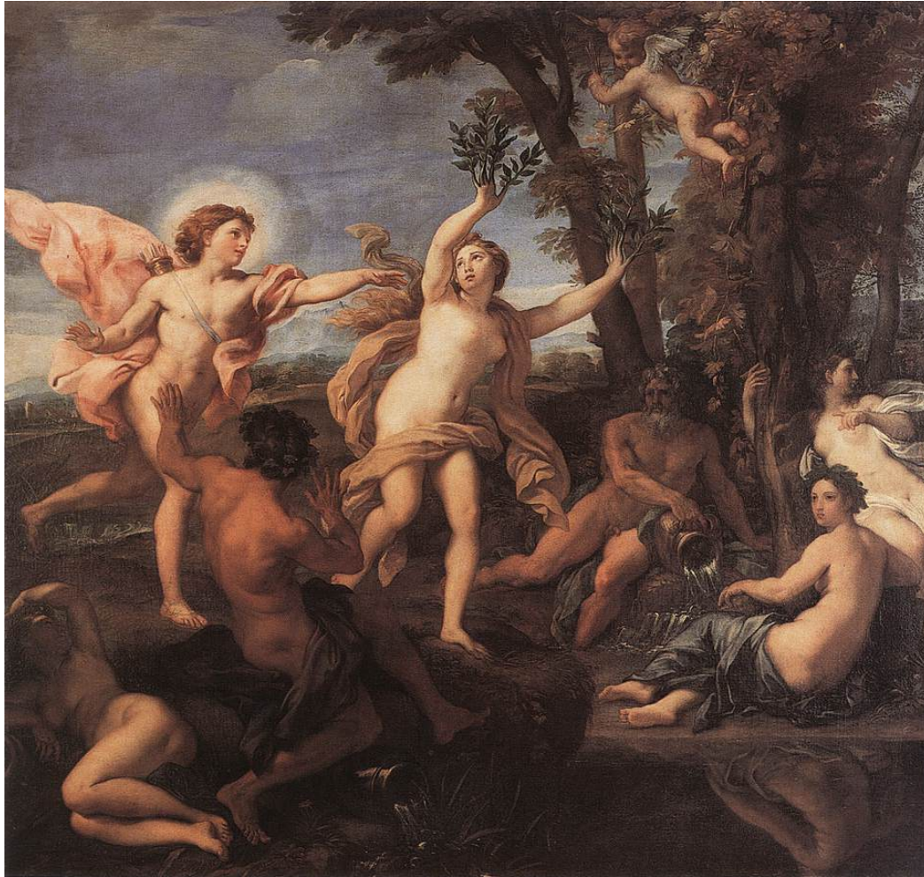
Fig. 5. Carlo Maratti, Apollo and Daphne , 1681 Oil on canvas, 221.2 x 224 cm Brussels, Musées Royaux des Beaux-Arts.