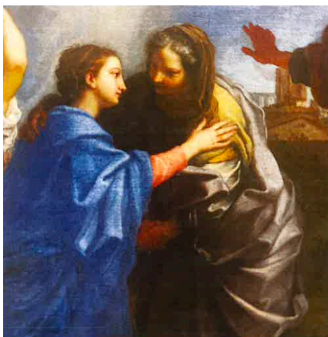
Fig. 3. Carlo Maratti, Visitation , 1666. Oil on canvas, 340 x 450 cm. Rome, Santa Maria della Pace.