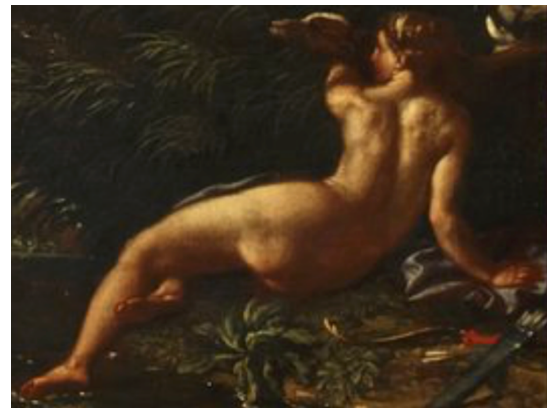
Fig. 6. Carlo Maratti, Diana's Bath , c. 1657. Oil on canvas, 110 x 154 cm Chatsworth, The Devonshire Collections