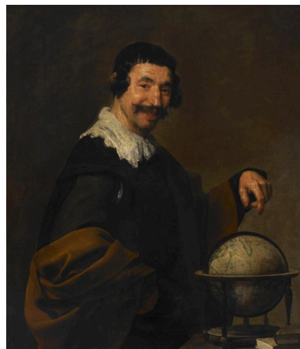
Fig. 8. Diego Velázquez, Demócrito (detail), c. 1630, oil on canvas. Musée des Beaux Arts Rouen.