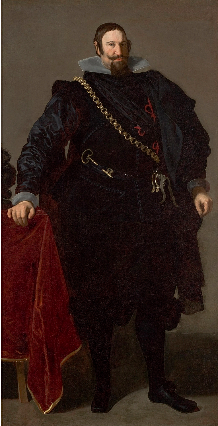
Fig. 6. Diego Velázquez, Portrait of the Count-Duke of Olivares , 1624, oil on canvas. São Paulo Museum of Art.