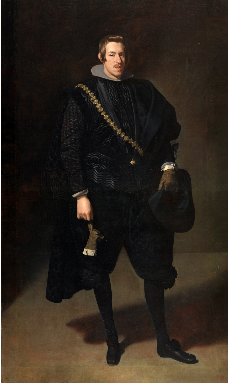
Fig. 9. Diego Velázquez, Portrait of the Infante don Carlos , 1626, oil on canvas. Madrid, Museo Nacional del Prado.