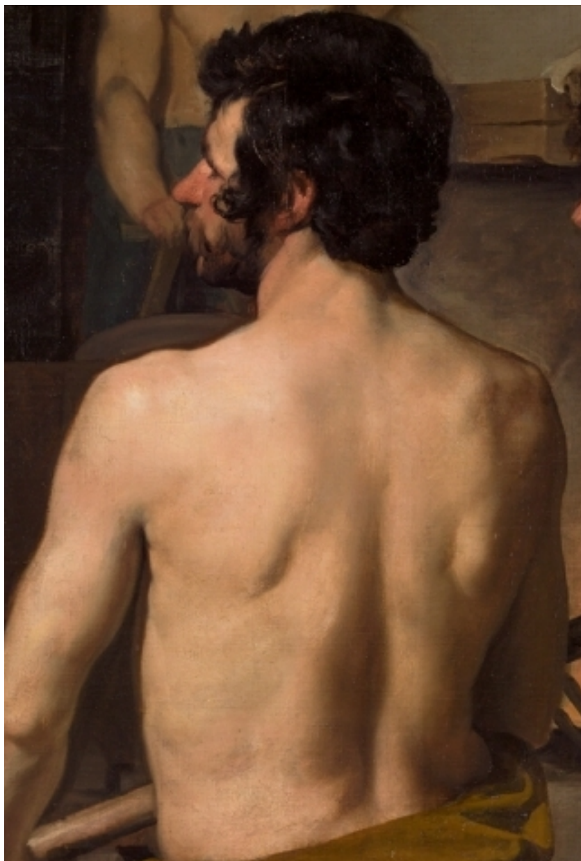
Fig. 7. Diego Velázquez, La fragua de Vulcano (detail), 1630, oil on canvas. Madrid, Museo Nacional del Prado.