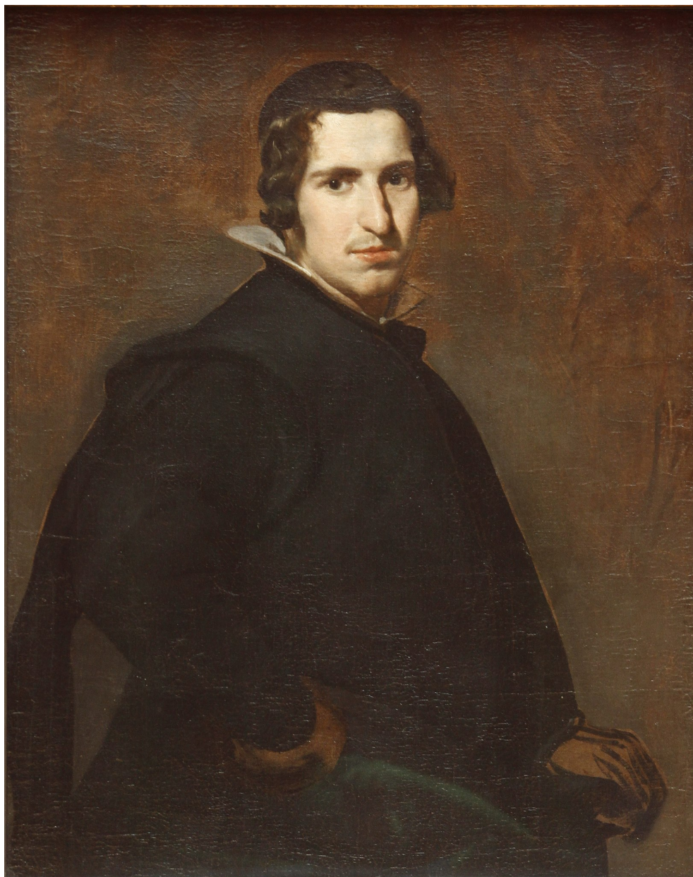
Fig. 5. Diego Velázquez, Joven noble español , c. 1626-1627, oil on canvas. Munich, Alte Pinakothek.