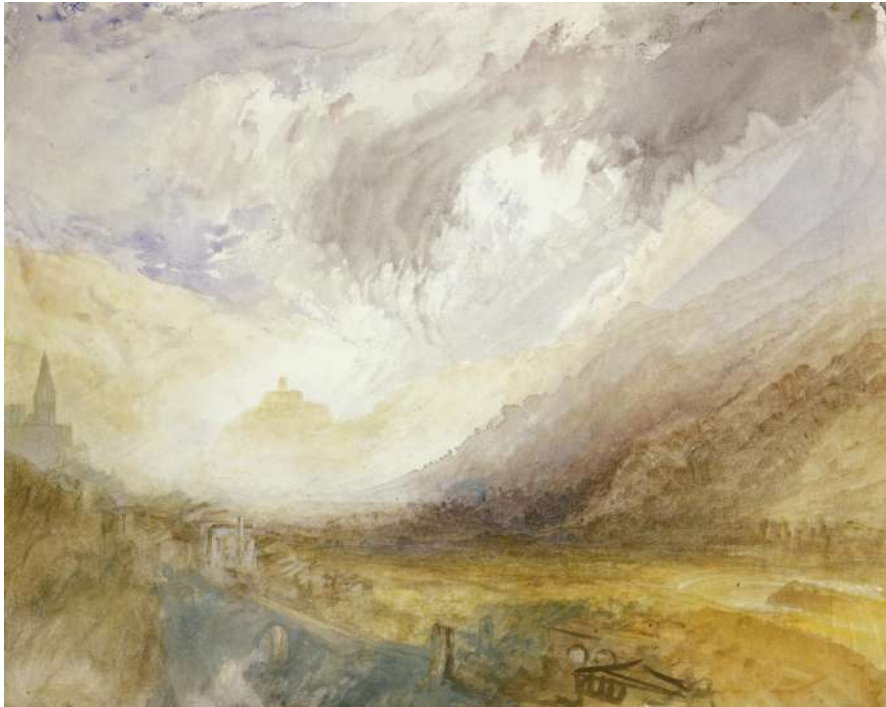
Fig. 3. Joseph Mallord William Turner, From Chambave looking down the Val D'Aosta towards Ussel , 1836, watercolour and bodycolour on paper. Edinburgh, National Galleries of Scotland.