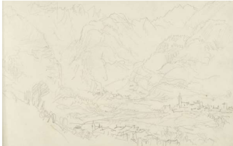
Fig. 1. Joseph Mallord William Turner, The Mont Blanc Massif, Le Chetif and Courmayeur from above Dolonne in the Val d'Aosta , 1836, pencil on white wove paper, Folio 83 Verso. London, Tate Gallery.

through the Val d'Aosta, recording both broad panoramas and specific sites of historical or pictorial interest. In pencil, Turner filled the Val d'Aosta Sketchbook (Tate, Turner Bequest CCXCIII) with rapid notations of peaks, glaciers, and town (see for example Fig. 1).