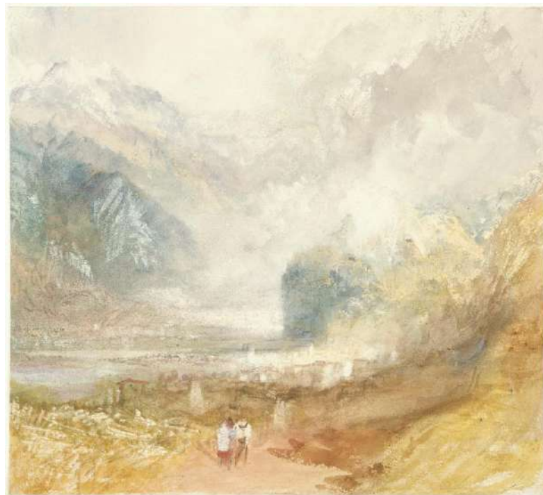
Fig. 2. Joseph Mallord William Turner, Aosta , 1836, transparent and opaque watercolour. Boston, Museum of Fine Arts.

He subsequently elaborated some of these into more developed watercolour studies. A clear example of this practice is Aosta , now at the Museum of Fine Arts at Boston: a scene focusing on the ancient city of Aosta in the broad valley below, where sunlit white houses contrast with blue-green Alpine shadows (Fig. 2). This work, also dated 1836 and executed in transparent and opaque watercolour, shares a similar size and technique to the Brenva subject, and likewise originated from this tour.