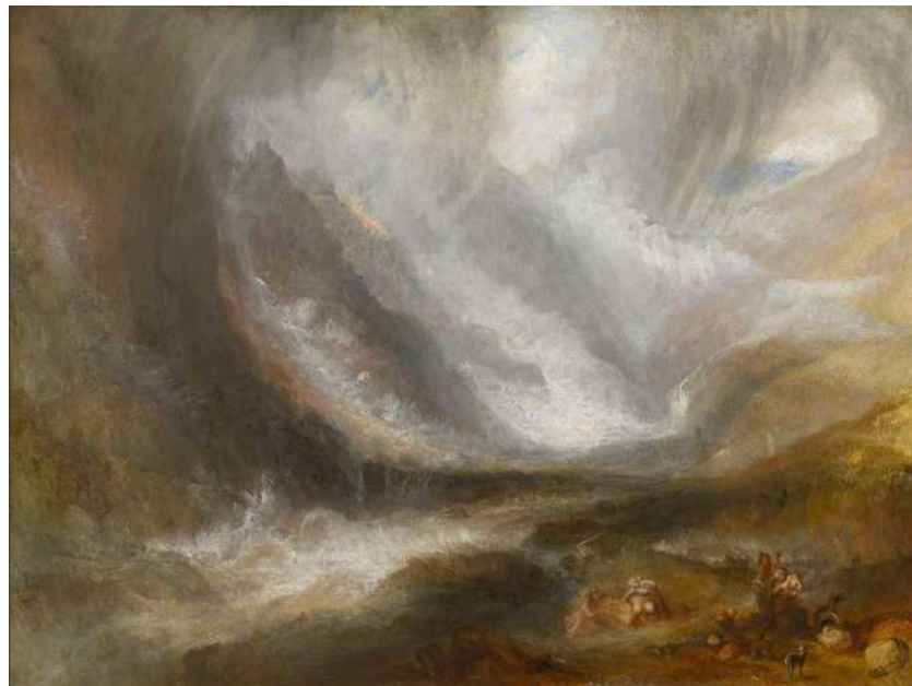
Fig. 4. Joseph Mallord William Turner, Valley of Aosta: Snowstorm, Avalanche, and Thunderstorm , 1836-1837, oil on canvas. Art Institute of Chicago.

Studies such as our View of the Brenva Glacier would have also provided Turner with essential information during the painting of major oils of the period, such as Valley of Aosta: Snowstorm, Avalanche, and Thunderstorm , exhibited in 1837 and now at the Art Institute of Chicago (Fig. 4).