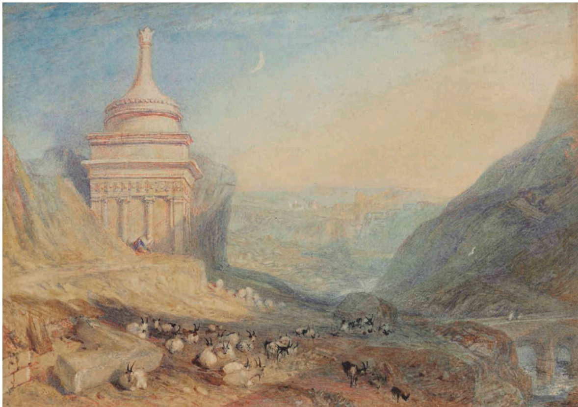
Fig. 2. J.M.W. Turner, The Valley of the Brook at Kidron, Jerusalem (Absalom's Tomb) , pencil and watercolour with scratching out, 14.5 x 20.6 cm. Lusail Museum's collection in Doha, Qatar Museums (accession number OM.1500).

Notoriously, Turner never visited these sites in person, however, as John Ruskin commented, "of one thing I am certain, Turner never drew anything that could be seen, without having seen it. That is to say that though he would draw Jerusalem from someone's sketch, it would be, nevertheless, entirely his own experience of ruined walls". 4