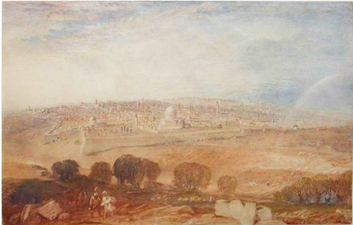
Fig. 3. J.M.W. Turner, Jerusalem from the Mount of Olives , watercolour on paper, 13.7 x 20.5 cm. Jerusalem, The Israel Museum.