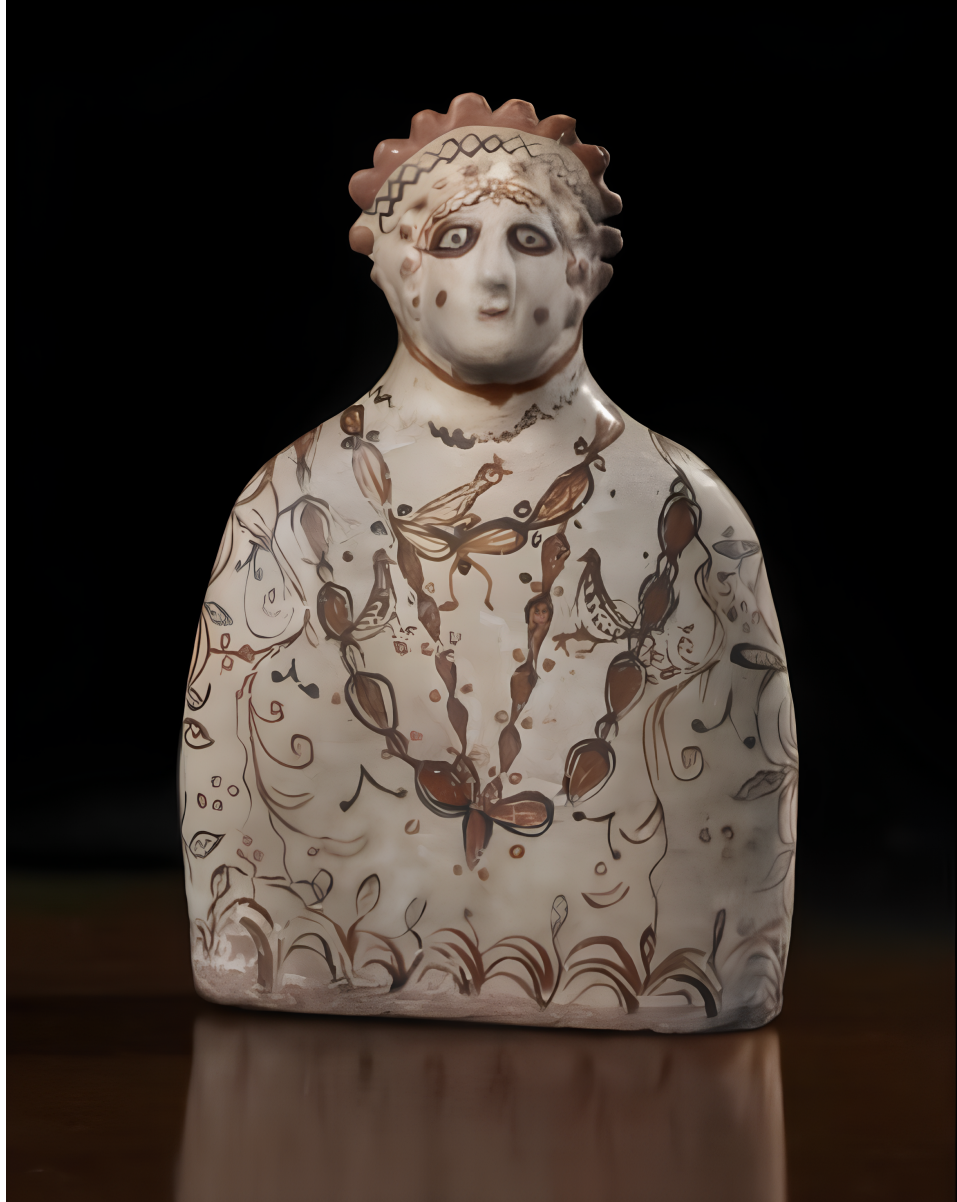
Bust of a Goddess, Phrygian, ca. 5th-4th century B.C; terracotta, height 25.5 cm (10 in.).