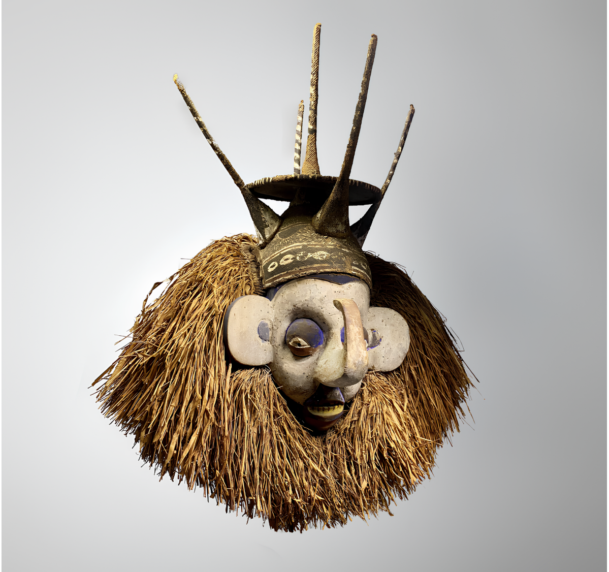
Yaka artist, Mask (ndemba) , Democratic Republic of the Congo, late 19th–early 20th century; wood, fibre, and pigments.