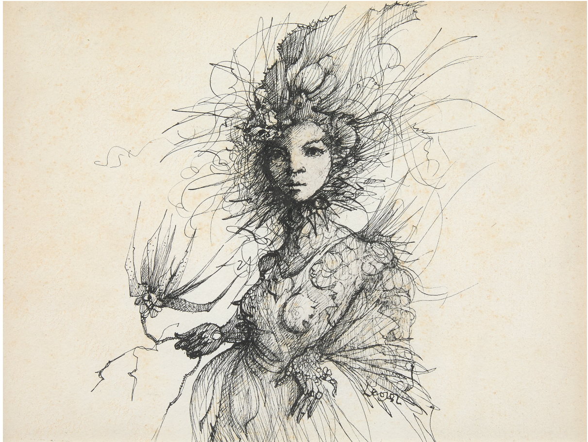
Leonor Fini (Buenos Aires 1907 – Paris 1996), Self-portrait with a Dragonfly , signed lower right “Leonor”; pen and ink on paper, 15.5 × 20.5 cm (6 1/8 × 8 1/8 in.).