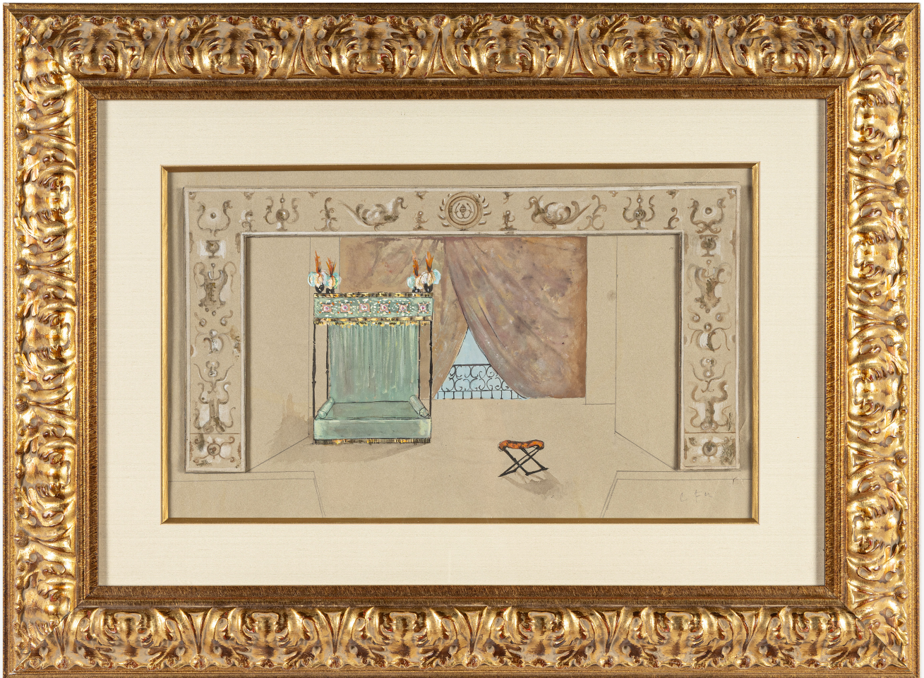
Leonor Fini (1907–1996), Set Design for “La Mégère Apprivoisée” , 1957, signed lower right ‘L. Fini’; collage, pencil and watercolour on paper, 32 × 53 cm (12 5/8 × 20 7/8 in.).