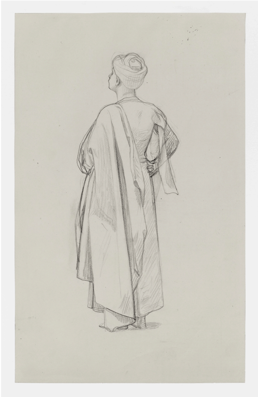
Jean-Léon Gérôme (1824–1904), Standing figure seen from behind, study for The Carpet Merchant , pencil on paper, 32.3 × 20.3 cm (12 3 / 4 × 8 in.).