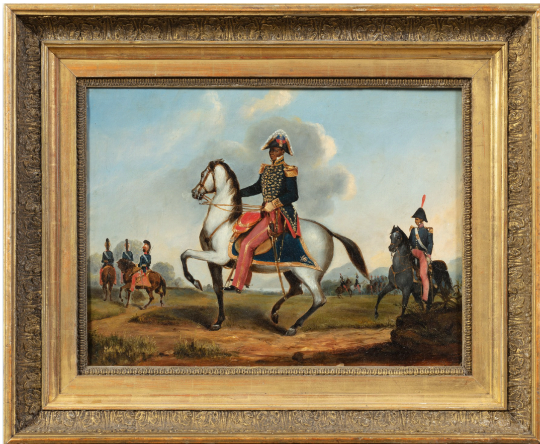
Johann Gottfried Eiffe, Portrait of Jean-Baptiste Riché, Comte de la Grand-rivière-du-nord (c. 1780–1847), oil on canvas, 28 × 35.5 cm (11 × 14 in.).